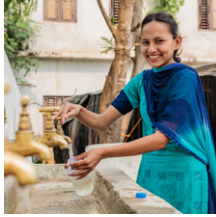
Leave a lasting legacy of love p2