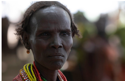
Ayoyo in southern Ethiopia at a Caritas cash distribution to help rural farmers cope with extended drought and hunger.

Now, imagine a world where your compassion and gen-