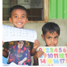
Mary MacKillop Today p6