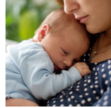
Share our Faith and Works p8

Caritas Australia.....p2-3 P: 0438 530 908 | E: legacyoflove@caritas.org.au