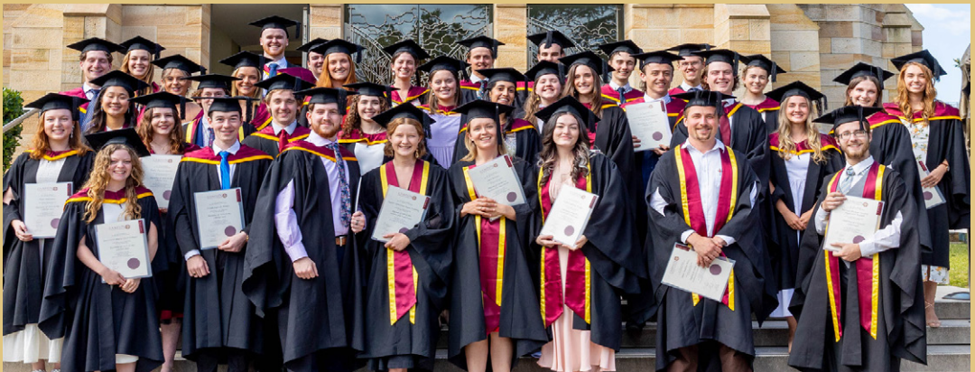
Class of 2022