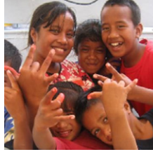
Do something amazing p4